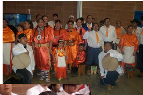
Northern Cheyenne Junior Handgame Team